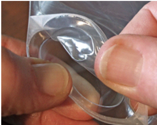
Photo 2. Opening without much effort