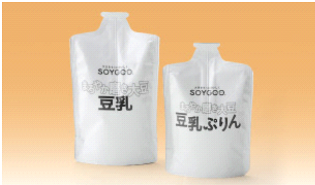
Photo 4. Soy milk

Link(in Japanese): http://www.orihiro.com/machinery/onpack_t-pouch/