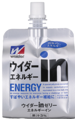
Photo 5. Energy drink packaged by Hosokawa

Link (in Japanese): http://www.hosokawa-yoko.co.jp/identity